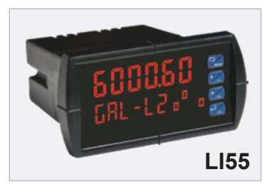
Commander™ Multi-Tank Level Controller Level Controller